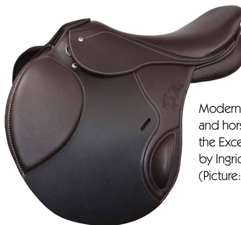
Modern, comfortable and horse-friendly – the Excellence powered by Ingrid Klimke